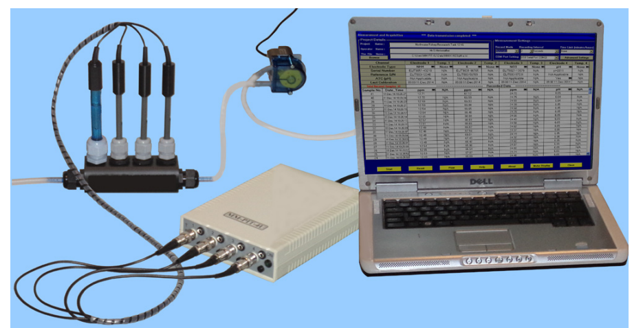
Flow-through Cell with 1xpH, 3x Ion selective Electrodes and 4-channel Monitor